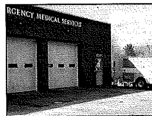
EMS Station #3 Osborne and Albany-Shaker Road

Location: EMS Station #3 494 Albany-Shaker Road Loudonville, N.Y. 12211