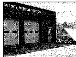
EMS Station #3 Osborne and Albany-Shaker Road

Location: EMS Station #3 494 Albany-Shaker Road Loudonville, N.Y. 12211